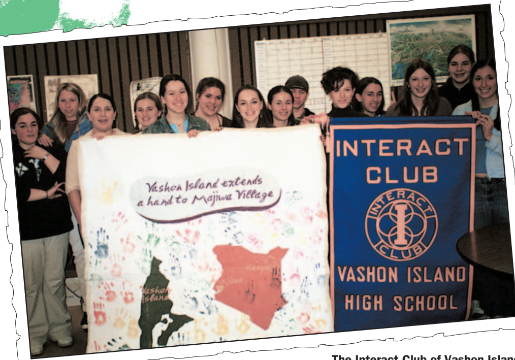
The Interact Club of Vashon Island High School has made it possible for some Kenyan orphans to continue their schooling.

E ver since you were five or six years old, the classroom has been an almost daily part of life. There have always been teachers to teach you how to make sense of words on a page, to add and subtract numbers, and to learn the many other skills you will need as an adult.