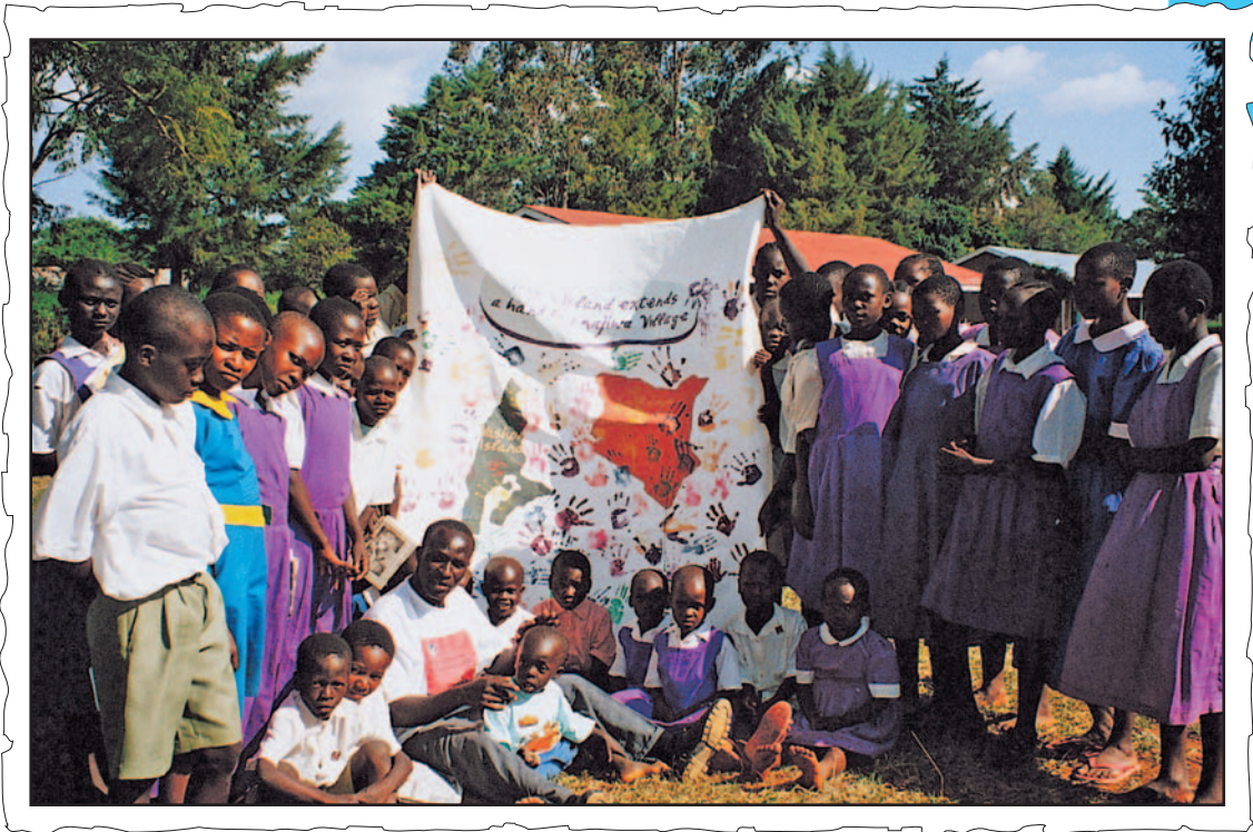
The banner, which traveled thousands of miles, is held up by Majiwa students.

In fact, educating girls may be the smartest way to bring families out of poverty. Girls who have been to school are more likely to have smaller families, and healthier, better-educated children. The benefits of this education range from being able to read instructions on pill bottles, to making better decisions, to getting a job.