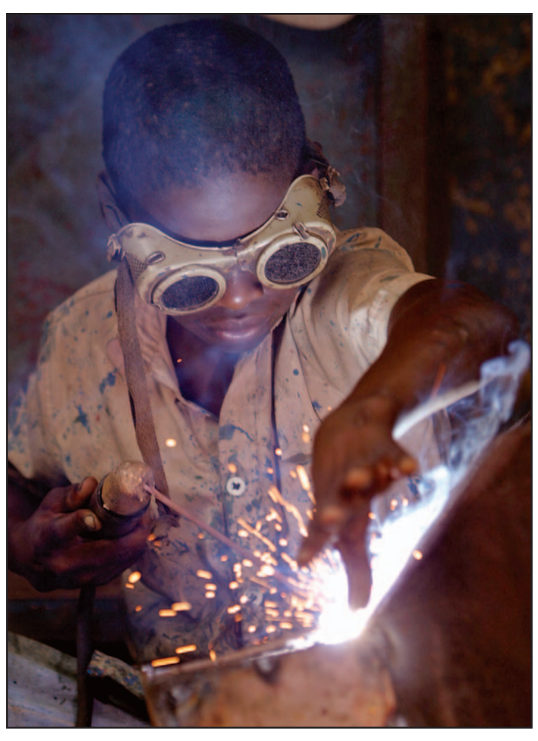
Not only are children working rather than going to school, but it is not uncommon in Africa to find children doing dangerous work, such as welding.

As Americans, we are also connected to global child labor, directly and indirectly. About 70 percent of child labor takes place in agriculture. This includes the harvesting of bananas in Central America and cocoa beans for chocolate in West Africa and the picking of coffee beans and tea leaves in Latin America and Africa. Some of these agricultural products end up on our supermarket shelves. For better or for worse, we are connected to some of the most unacceptable forms of child labor.